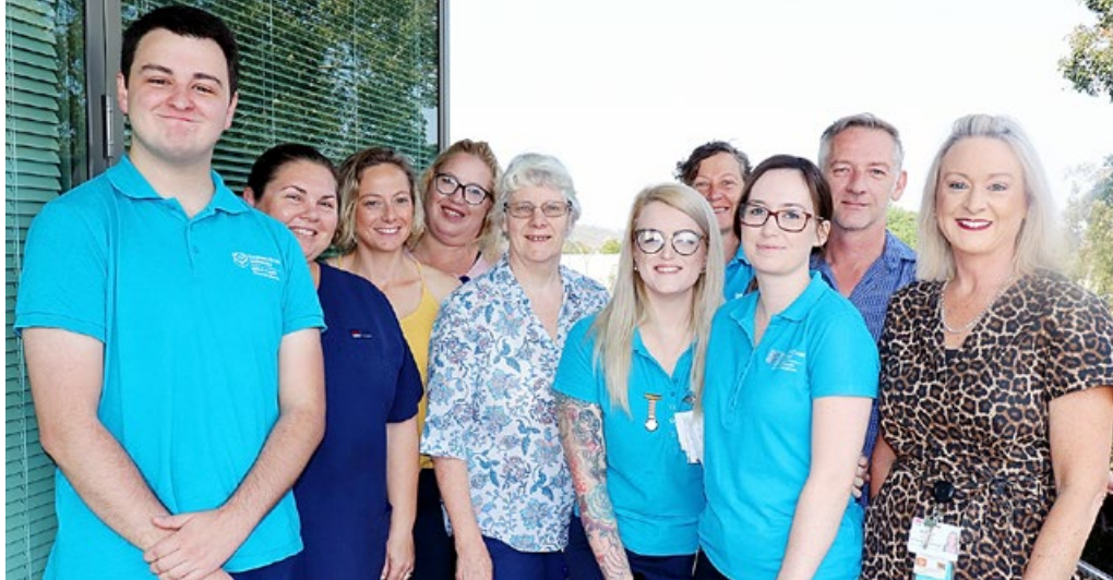
Richmond Community Nursing team members and students

"I must be honest and say it was not on my list for future possible career prospects post-degree. However, it has catapulted to the top of my list."