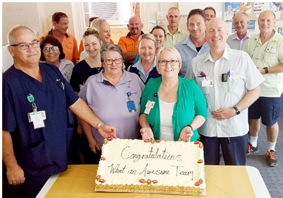
Murwillumbah District Hospital staff celebrate their great results

Meanwhile Byron Central Hospital was rated by patients as the cleanest facility in NSW, with 93 percent agreeing it was 'very clean'.