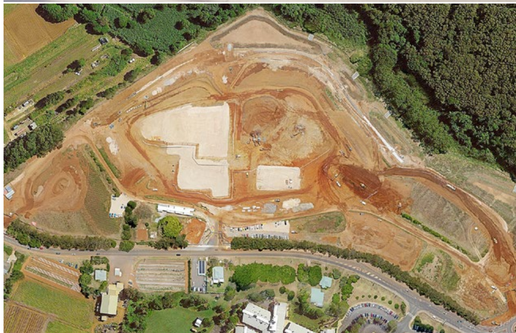
Top, artist's impression of the new Tweed Valley Hospital. Bottom, aerial view of the site works