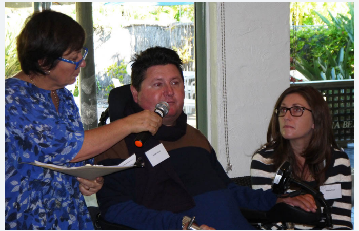
A number of consumer representatives shared how vital it was for their health providers to work as a team.