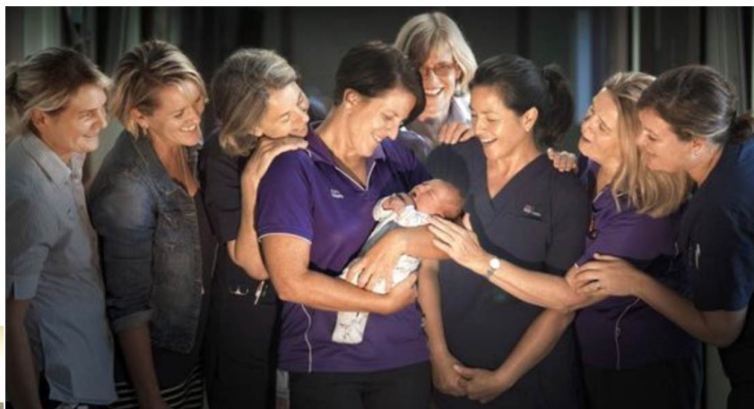
Above - Grafton Base Hospital (GBH) Midwives

On behalf of the Nursing and Midwifery Directorate I wish you a happy International Nurses' Day – hoping you have a wonderful one.