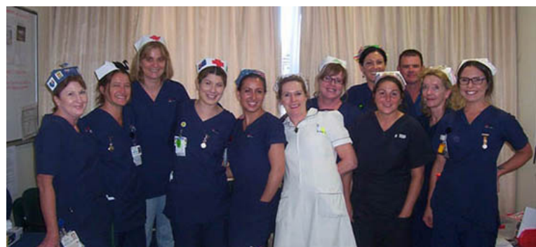
Above: TTH surgical Team.

Anaesthetics in the Surgical Services Departments.