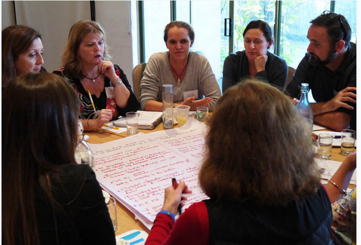
“What is integrated care?” - Participants worked in small groups to identify local barriers to integrated care.