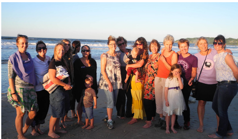
Midwives and student midwives from Tweed Lismore and Mullumbimby walked with friends, children and clients from Belongil Beach to Main Beach Byron Bay. The walk raised money for the The Rhodanthe Lipsett Trust. The Rhodanthe Lipsett Trust provides financial assistance to Aboriginal and Torres Strait Islander students of midwifery.