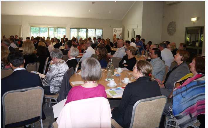
Some of the 100 participants who attended the Workshop