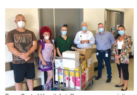
Byron Central Hospital staff were very appreciative of the donations made possible by the efforts of Front up for the Frontline fundraising efforts.