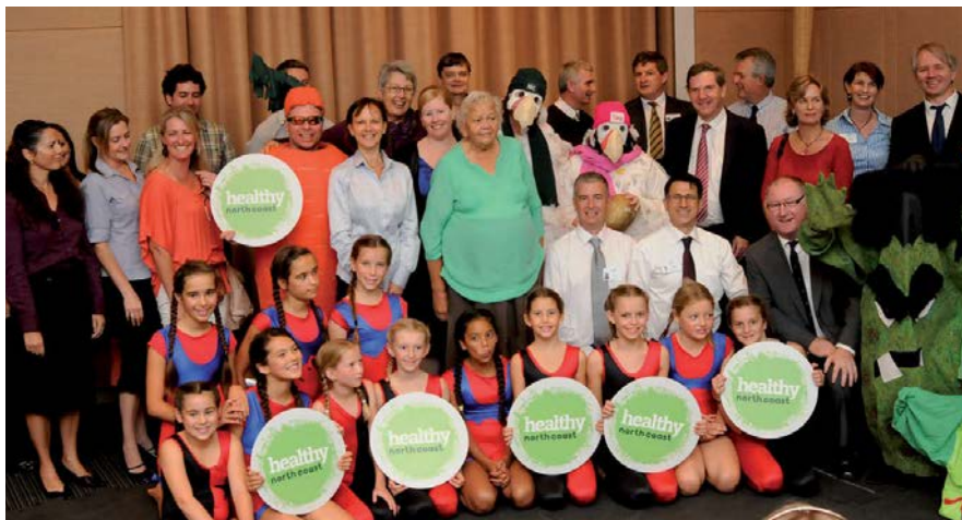
Participants attending the Health North Coast Website Launch

Over the past 10 years our lives have changed with cyber networking. This phenomenon has shrunk the planet into a tablet or an iPad. It is a river that no one can stop and it's enabled NCML to harness these benefits for the community in the form of a Healthy North Coast.