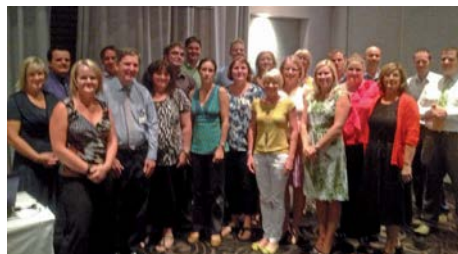
Staff attending the Leading Better Patient Outcomes Day held in Coffs Harbour.

Therefore, it is important that we make our input into the development of the State Health Plan, so we give ourselves the opportunity to influence the directions and priorities it sets.